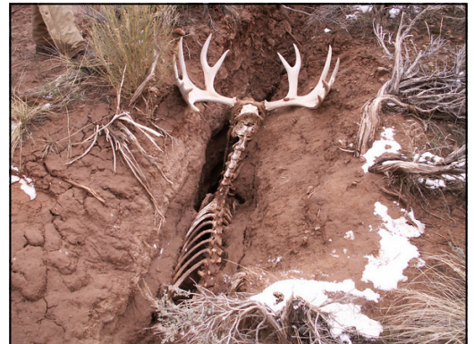
One mis-step by this moose fell into a crevice where it died. Scavengers picked him clean.