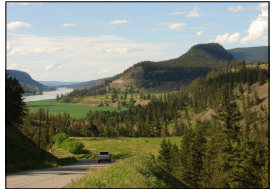
Traveling east on Highway 20 approaching the Sheep Creek Bridge